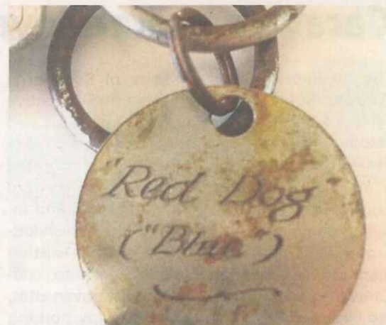
• Red Dog's original collar from the 70's